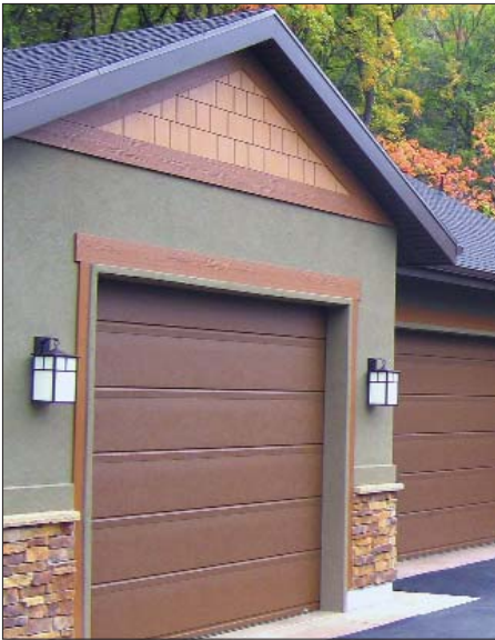
Martin Flushline model door with Rusty Iron powder coat finish