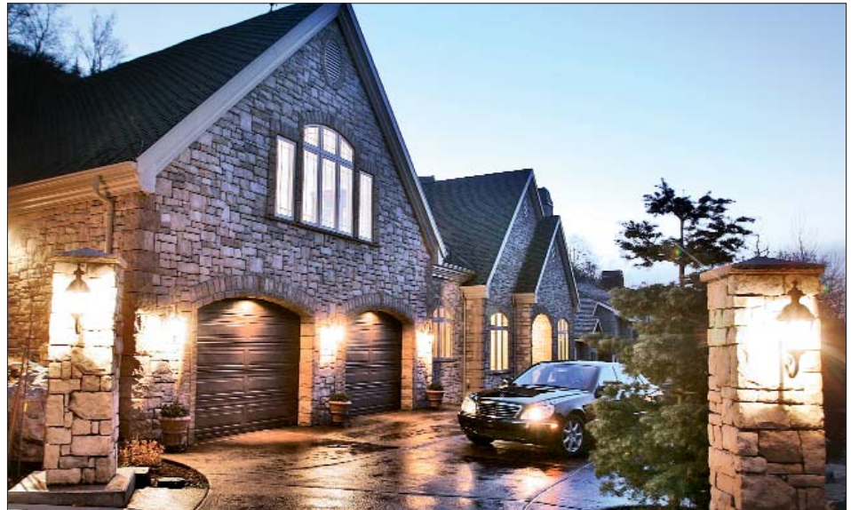
Martin Ranch model door with bronze metallic powder coat finish