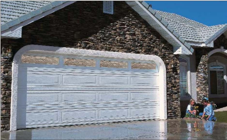
Martin Ranch model door with Amore ® Vista windows